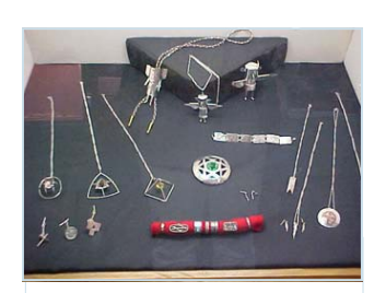
Multiple levels draw the eye.