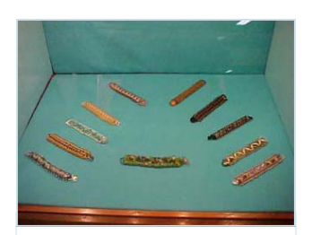
Notice the symmetry in the layout.