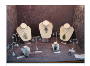
The display color choices accent the specimen pieces beautifully.