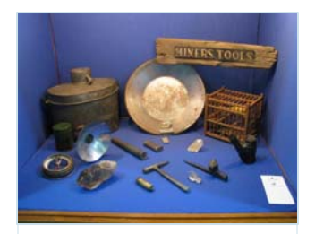
The mining theme of this display falls into the Education category.