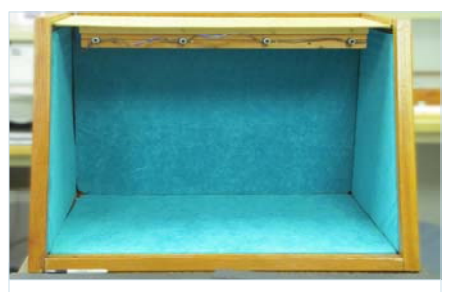
An empty display case ready for the show.

The cases may contain anything relevant to JGMS. Cabochons or cut stones, finished jewelry or mineral specimens, educational or site specific exhibits are all welcome additions to the displays. There are even categories for petrified wood and gem trees.