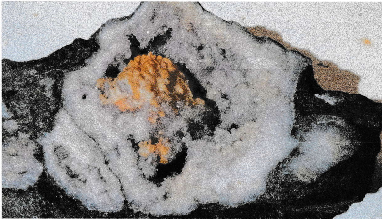
Pink Dolomite and Calcite on Lavender Quartz

Some recent finds at Kings Mountain.